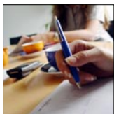
Perfect for Presentations, Spreadsheets, Charts, Invoices and other important Documents.