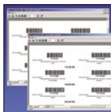
Software for Forms and Labels