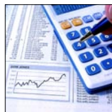
Cost saving via Duplex Print