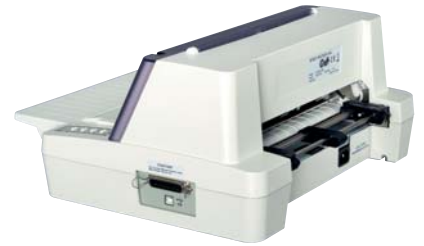
Right side & interfaces FB-380