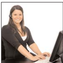
Customer service area