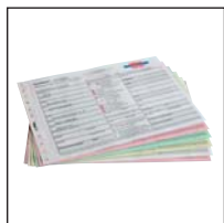
Continuous forms and duplicates