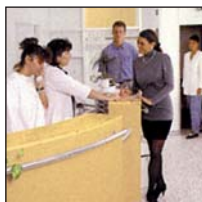
Front office applications