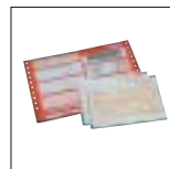
Transfer slips and courier letters

SEIKO Precision Solutions for all your printing needs