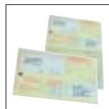
Doctor's certificates and prescriptions