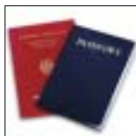
Passports, savings books and service booklets